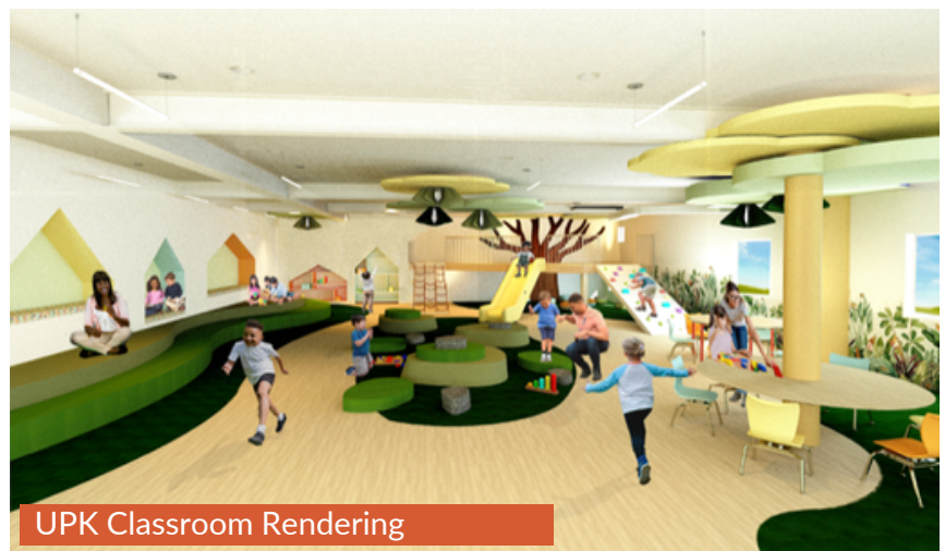
UPK Classroom Rendering

The construction of an Early Childhood Center with four new classrooms, a secure entrance and a multi-purpose room/indoor playground at Windermere will create a student-centered space dedicated to the full-day prekindergarten program. Incorporated into the classroom design are features that will support the UPK curriculum such as flexible individual and group seating areas and play space.